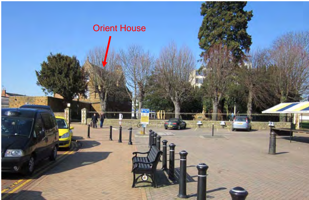
Southern approach from Swansgate Car Park